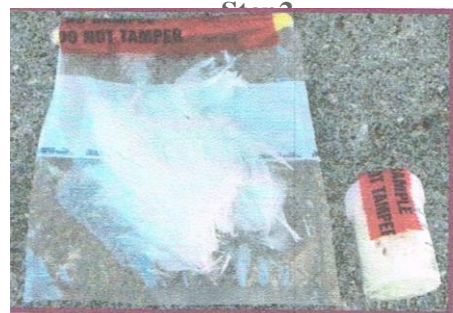
Steps 3, 4, and 5

For more information on submitting feather samples, visit tvmdl.tamu.edu .